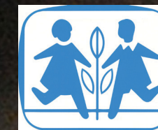
SOS Children's Villages